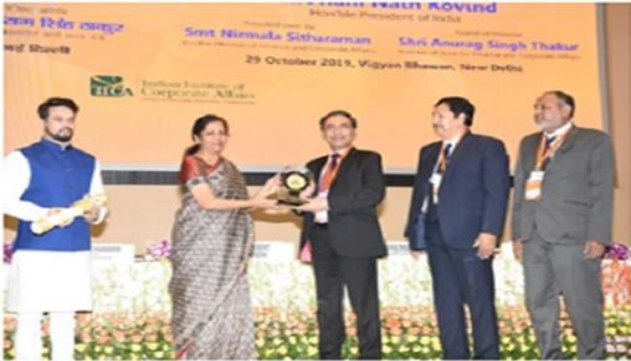
1 st National CSR Award

1 st & 2 nd – 2 Consecutive National CSR Awards-Sports Promotion(Sports Academy,Ranchi)