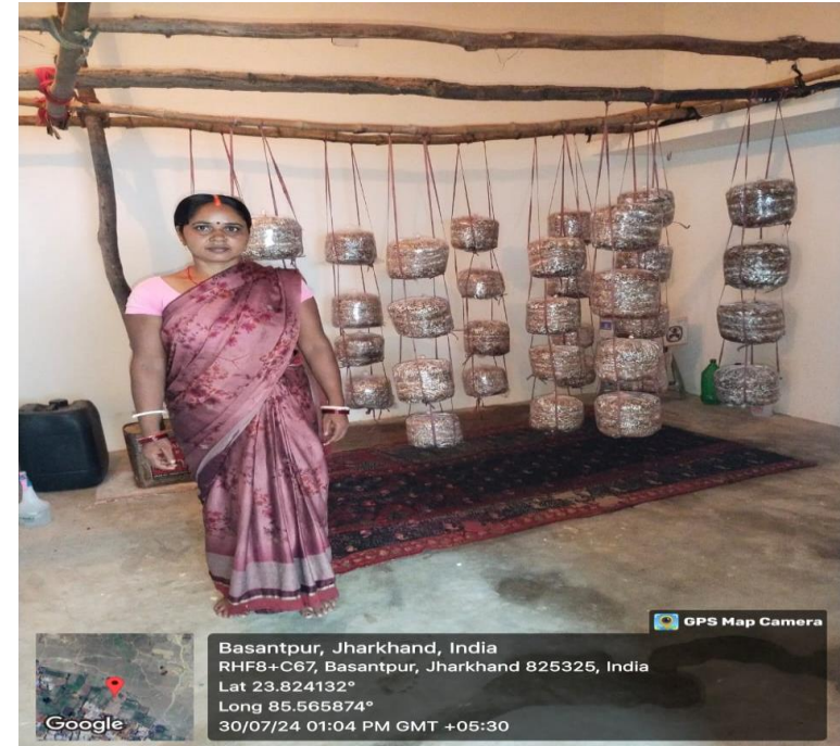
Beneficiary with mushroom at her home

Project to empower 30 women through mushroom cultivation training and enhancing livelihoods for marginalized communities through YUVA(implementing agency) at Hazaribagh.