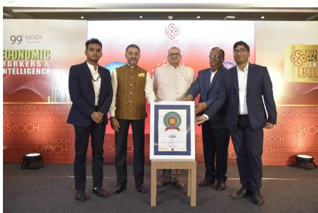
SKOCH Award 2024