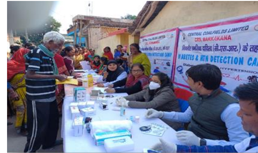
Rural Health Camp