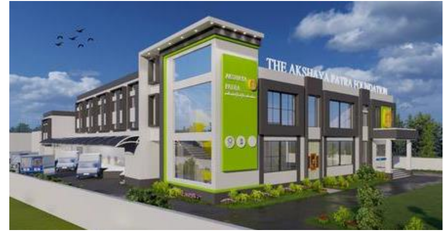
Proposed Centralized Kitchen at Ramgarh

A Project for Construction of Centralized Kitchen for delivering Mid Day Meals to 50000 students in government schools of Ramgarh