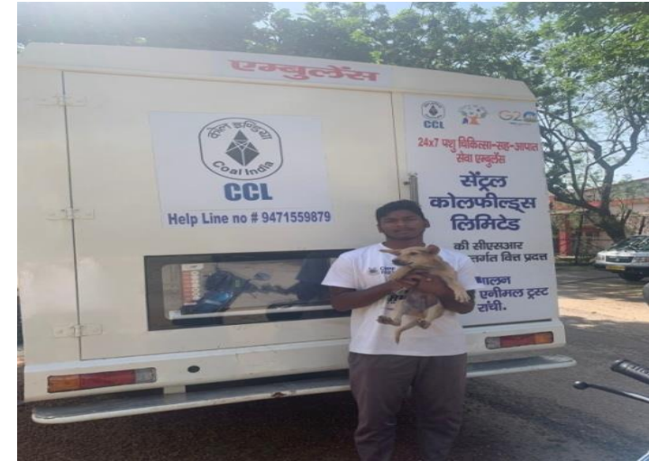
Animals undergoing treatment

The first-ever "Hospital on Wheels" for providing medical treatment to stray animals in Jharkhand