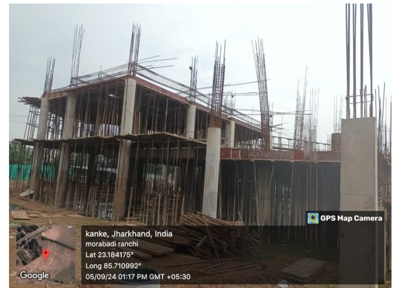
Work in progress