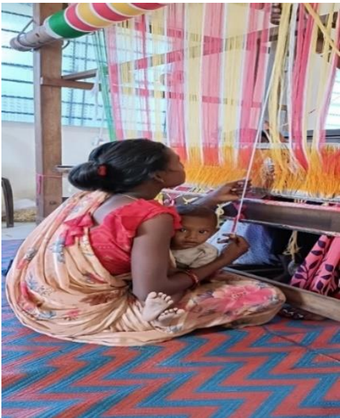
Training session of women