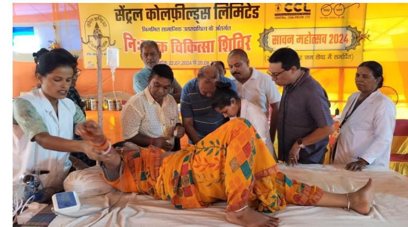
Special Health Camp during Shrawan Mela at Deoghar