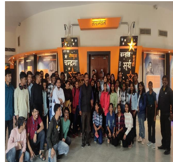
Students of CCL KE LAL & CCL KI LAADLI at Ranchi Science Museum