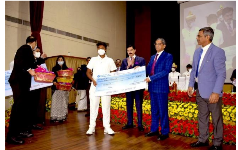
Ex-Hon'ble Chief Justice of India Shri N V Ramana handed over cheque to beneficiaries at Judicial Academy, Ranchi