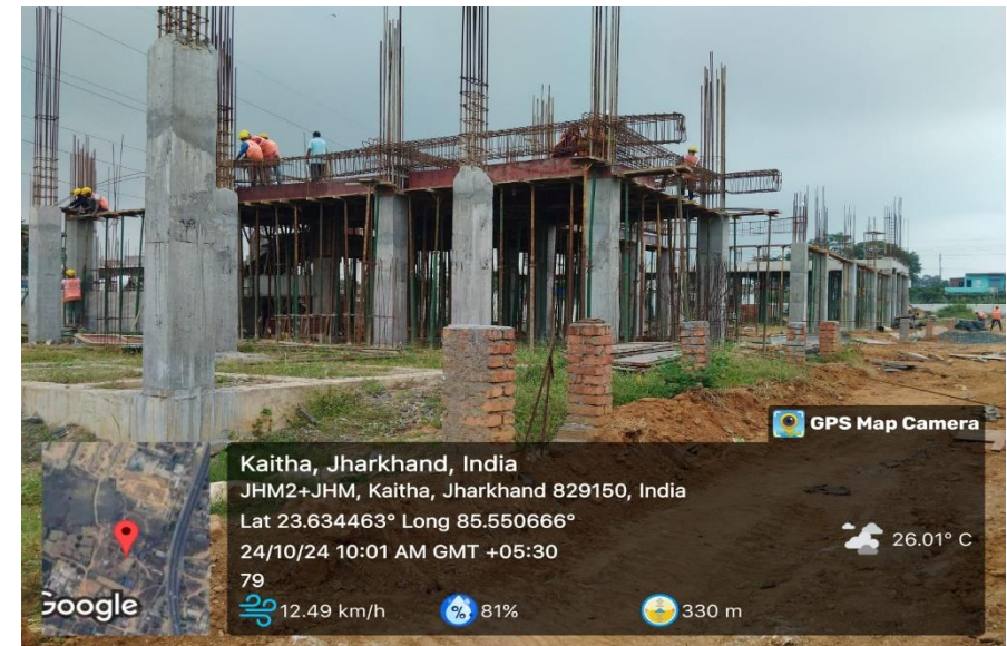
Work in progress