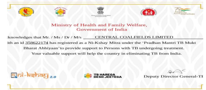
Ni-kshay Mitra Certificate of CCL