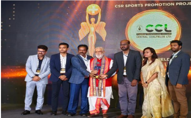
8th CSR HEALTH IMPACT AWARDS