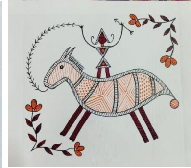
Painting by student of one of the beneficiary girl