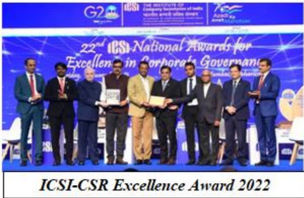
ICSI-CSR Excellence Award 2022

1 st & 2 nd – 2 Consecutive National CSR Awards-Sports Promotion(Sports Academy,Ranchi)