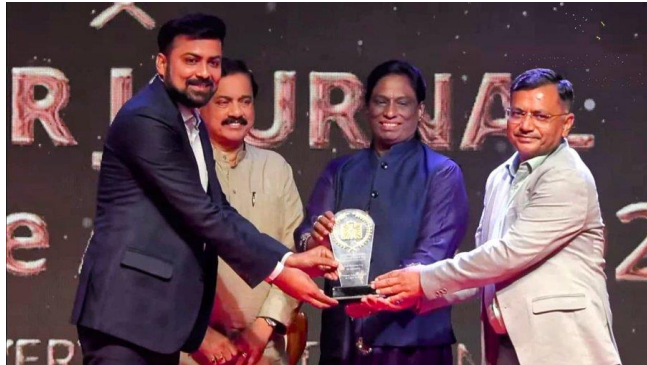
CSR Journal Excellence Award

“Best Corporate” Award as a 'Nikshay Mitra’ by Govt. of Jharkhand (2024)