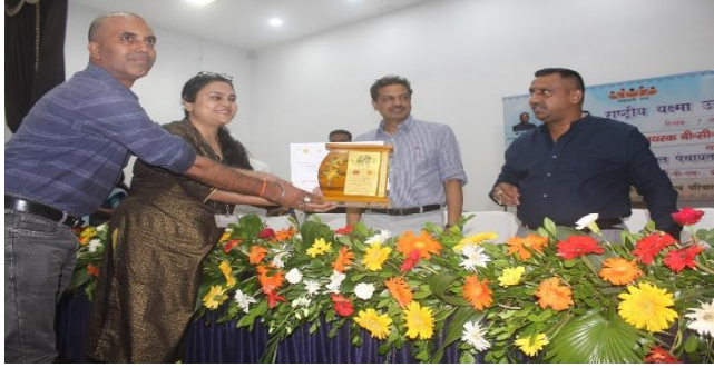
“Best Corporate” award as a 'Nikshay Mitra', a significant step towards eliminating tuberculosis (TB) in Jharkhand State (2024)

“Best Corporate” Award as a 'Nikshay Mitra’ by Govt. of Jharkhand (2024)