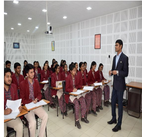
CCL's IITian officer taking class of Lal & Ladli

Free residential coaching for engineering entrance exam along with 10+2 education to underprivileged children (20 girls and 20 boys) from CCL command area.