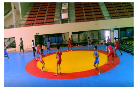
Cadets at Sports Acedemy, JSSPS